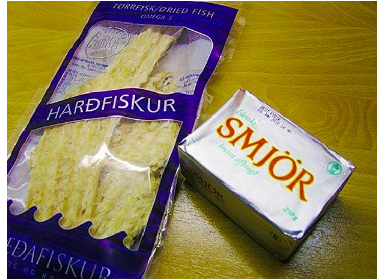
Dried fish and butter