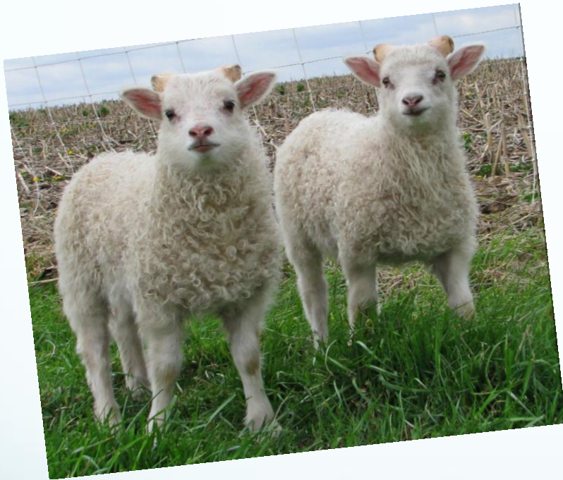
Icelandic Wool sweater