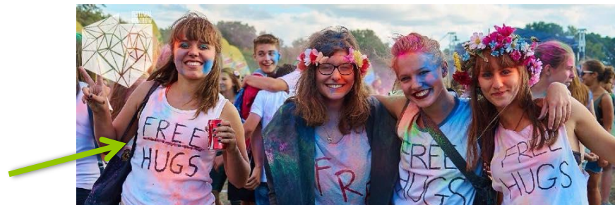
Me and my best friends on Festival of Colours.