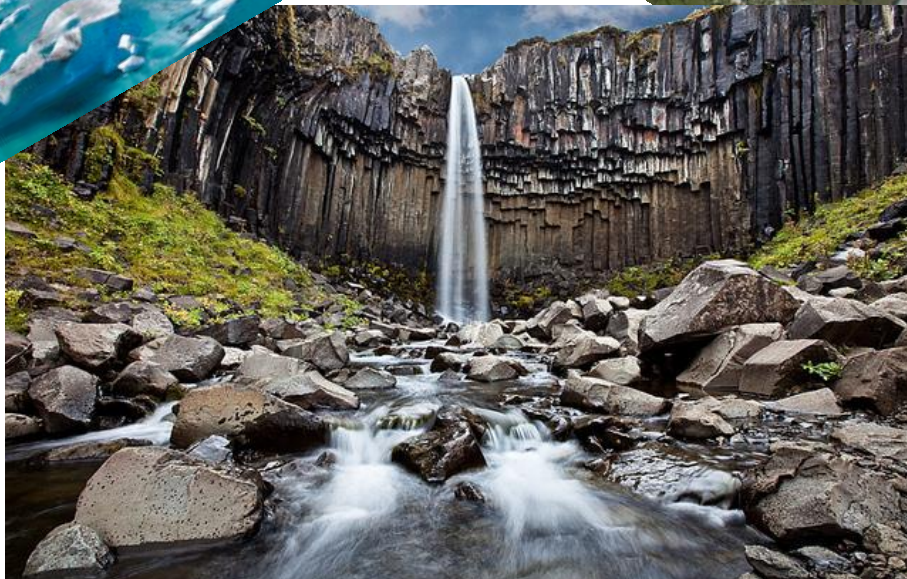
Svartifoss waterfall, located in National Park Skaftafell